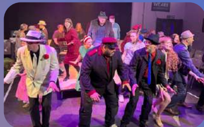
Caldicot Musical Theatre Society (CMTS)