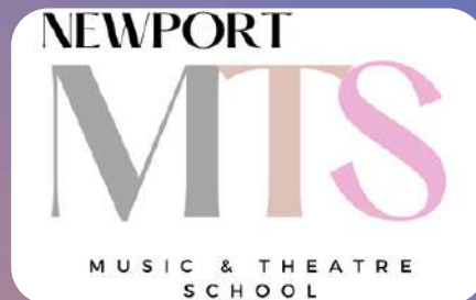
Newport Music & Theatre School